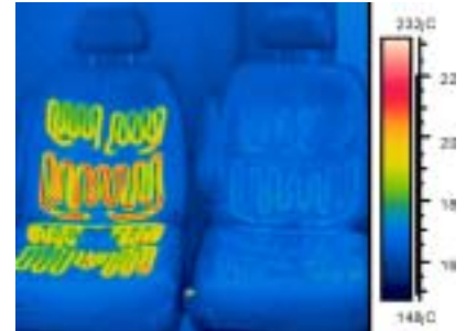
Heated Car Seats

Click here for a Map to FLIR Systems and Chevy's Restaurant